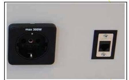
LAN connector as router access point