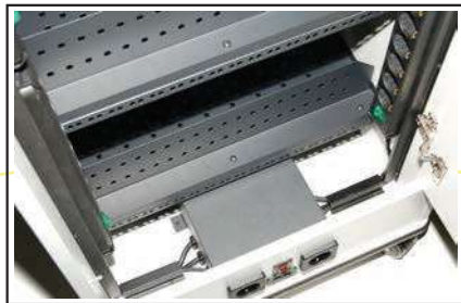
Control unit with 2 outside sockets and main switch