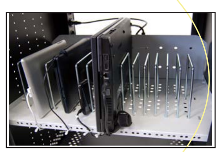
Diverse device charging